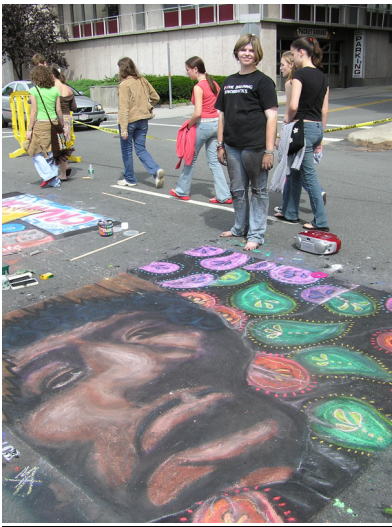
Providence Street Painting, 2004

Vision Statement Literacy in the Arts Task Force